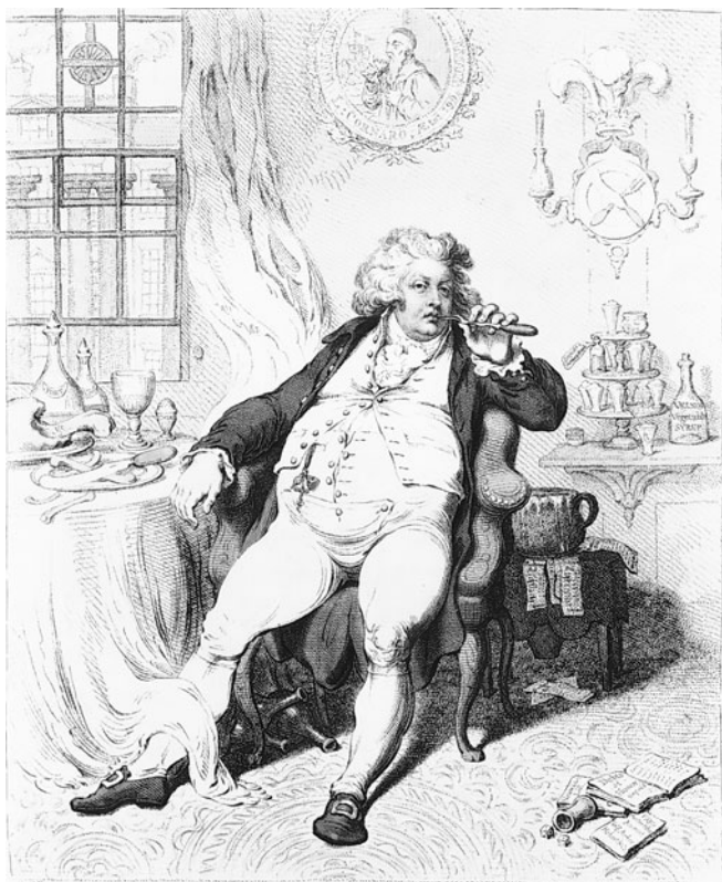
1. 'A voluptuary under the horrors of digestion'. George IV, as prince of Wales in 1792, surrounded by evidence of his extravagances – unpaid gambling debts (despite £161,000 voted by Parliament in 1787 to bail him out) and visible through the window his opulent London residence of Carlton House. A cartoon of a favourite victim by James Gillray, 1757-1815, the most brilliant and merciless of British caricaturists