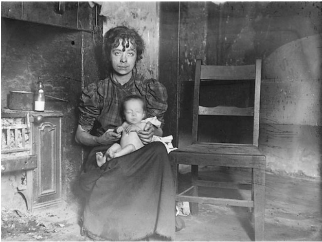
14. The residuum. A mother and child in Glasgow, c.1910, an unusual early flash photograph of one of Rowntree's 10 per cent living in primary poverty

Arnold's Culture and Anarchy (1869) described London's East End as containing 'those vast, miserable, unmanageable masses of sunken people'. Victorian reactions to it had been consequently local and personal, in the form of personal, charitable endeavour to alleviate the lot of those actually known to them or of particular categories of the so-called 'deserving poor'; for example, distressed gentlefolk. Now, at the turn of the century, systematic investigation not only raised alarm that an 'imperial race' could be so impoverished, but, by providing figures, suggested manageability and means of redress: until the scale of the problem was known, it could not be tackled. 'While the problem of 1834 was the problem of pauperism, the problem of 1893 is the problem of poverty', remarked Alfred Marshall, the leading free-trade economist; he implied that the problem of poverty had become both definable and solvable.