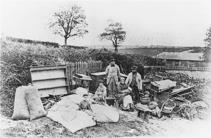
10. The agricultural depression. Farm labourers evicted at Milbourne St Andrew, Dorset, in 1874, for belonging to Joseph Arch's National Agricultural Labourers Union

hay, and straw production were not open to harsh foreign competition. In particular, the price of grain, the characteristic product of the eastern side of the country, fell dramatically, but farmers, especially the smaller ones, were slow to accept the permanence of this fall, or to adapt to the new demand for dairy products. The pastoral west was less severely affected.