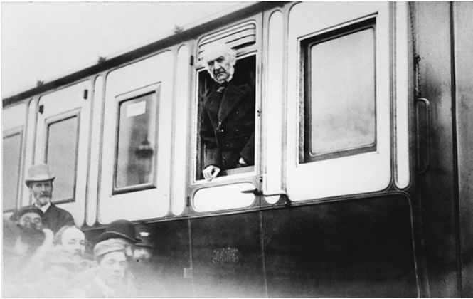
12. Gladstone on the stump, addressing a crowd in Warrington, Lancashire, from his election train in 1885

In domestic affairs, Gladstone's determination to control and reduce expenditure made positive reform difficult. In marked contrast to 1868–74, the government was noted for only one great reform, the county franchise reform of 1884. The enfranchisement of agricultural labourers was expected to deliver the county seats into the Liberals' hands, and Salisbury used the blocking power of the House of Lords to extract a great prize as a 'tit-for-tat': a redistribution bill allowed the boundaries of borough seats to be drawn much more favourably to the Tories. Thus the Tories were able to use a Liberal reform to create a political structure of single-member, middle-class urban and suburban constituencies, on which the basis of their subsequent political success rested for over a century.