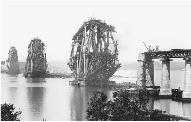
8. The Forth Bridge under construction, 1888-9, completing the railway network, which reached its zenith in the 1890s

probably had only a marginal impact on the British economy, but the ascendancy of 'free trade', in its larger sense of a national commitment to economic progress, was closely related to an entrepreneurial enthusiasm which all classes seem to have shared.