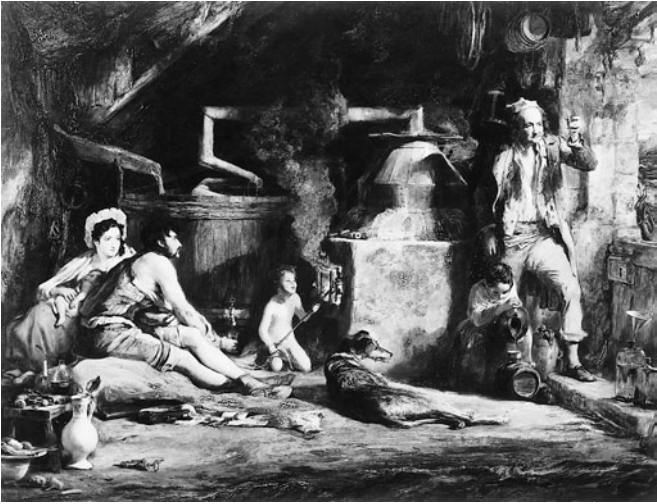
3. Sir David Wilkie, The Irish Whiskey Still of 1840. A romanticized view of rural Irish society before the famine, a period which, ironically, saw Ireland's greatest anti-liquor campaign under Father Mathew. Notice the good health of the peasants, and the potatoes in the lower left-hand corner

building materials, and china; this 'domestic' demand grew by some 42 per cent between 1750 and 1800. But in the same period the increase in export industries was over 200 per cent, most of this coming in the years after 1780.