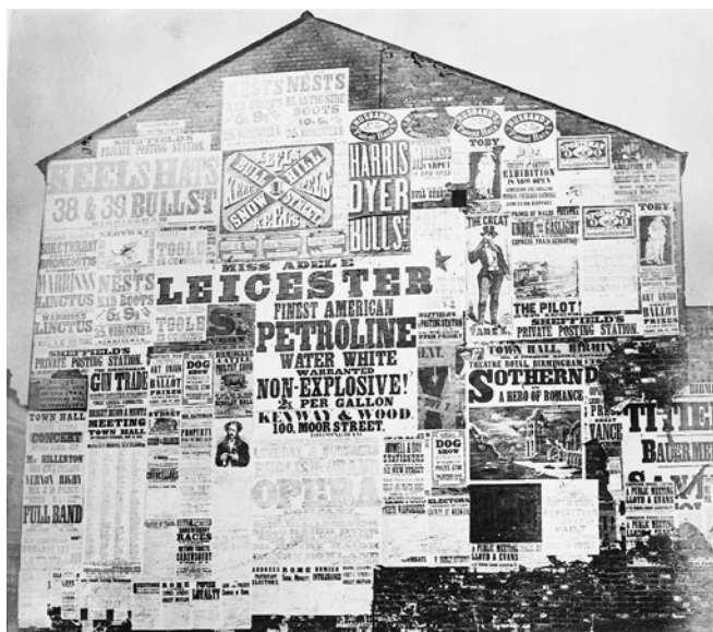
9. Victorian eclecticism: Birmingham advertisements at the time of the 1868 general election

the early twentieth century, everyone noticed how relatively quiet and clean town centres became.