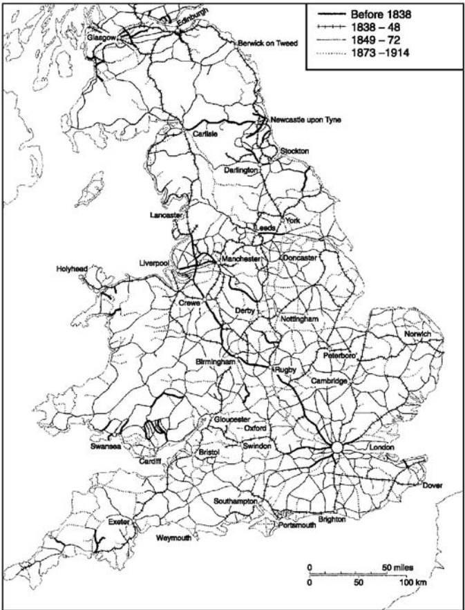
Map 2. Railways, 1825-1914