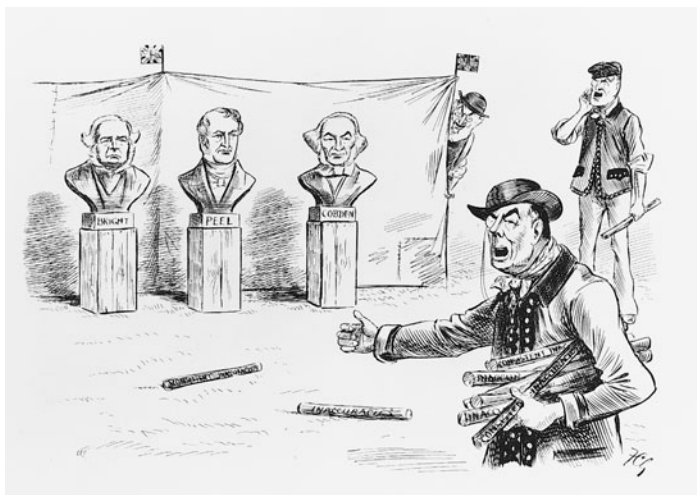
13. Joseph Chamberlain's Tariff Reform Campaign assaulting the free-trade tradition, as caricatured by F. Carruthers Gould in the Westminster Gazette , 12 November 1903

much more co-operation between industry and education, all things that only government could supervise. Second, they believed that an Imperial Customs Union (analogous to the German Zollverein of the early nineteenth century) could integrate the empire's economy, Britain producing manufactured goods, the colonies raw materials. Third, they saw tariffs, including duties on food, as the only alternative to direct taxation to pay for the social reforms necessary to make the imperial race fit for the increasingly harsh competition between nations which they believed the future would bring.