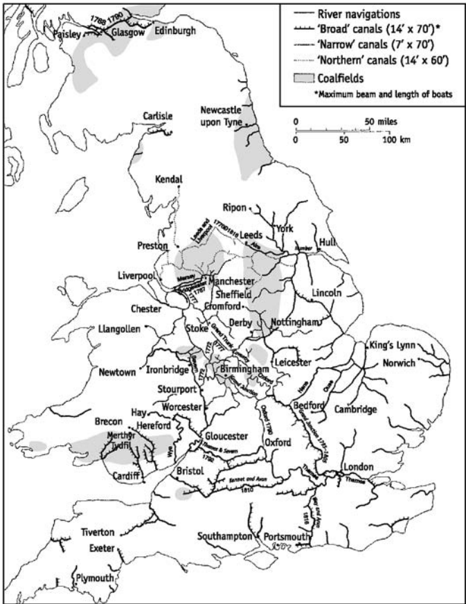
Map 1. The canal system in the early nineteenth century