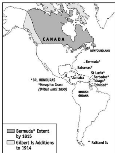
Map 4. The expansion of the British Empire, 1815–1914

territories came under direct British administration. In 1876, at the express wish of the queen, an Act was passed at Westminster which declared her 'empress of India'.